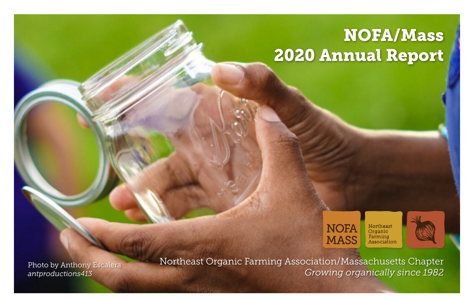
Now, 38 years later , we continue to promote cutting edge earth-friendly growing practices and the availability of the most nutritious, toxin-free food for all.