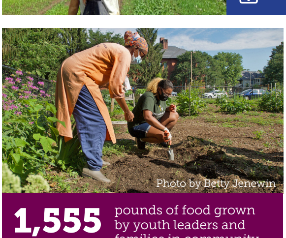
families in community gardens at Tapley Court Apartments